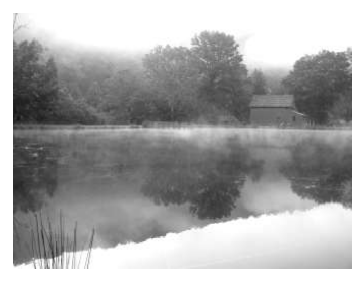
-A view from the General Store."