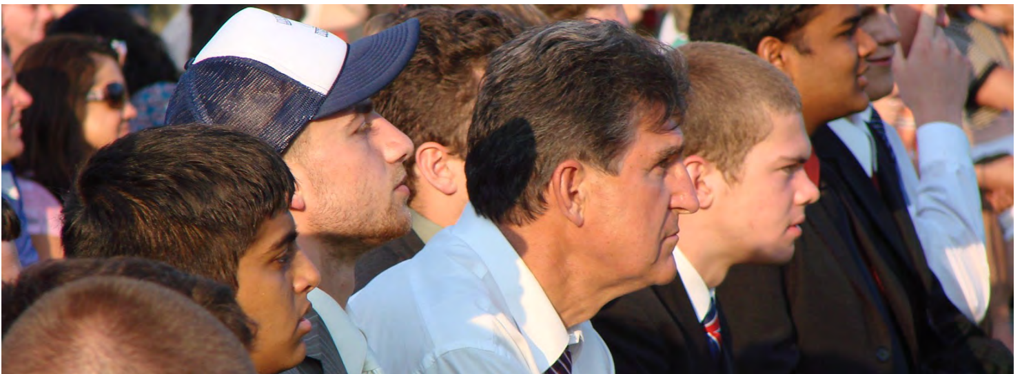
The newly elected MBS Governor and West Virginia's Governor Joe Manchin sit and watch the Formal Review on Wednesday.

In other news concerning Marion, a law has been passed that anyone passing through Marion County must take a detour. Anyone who doesn't do the "hammer time" dance on this detour could be arrested by Marion's sheriff. This should be a funny addition to the cool stuff that's been happening to all Boys State citizens.