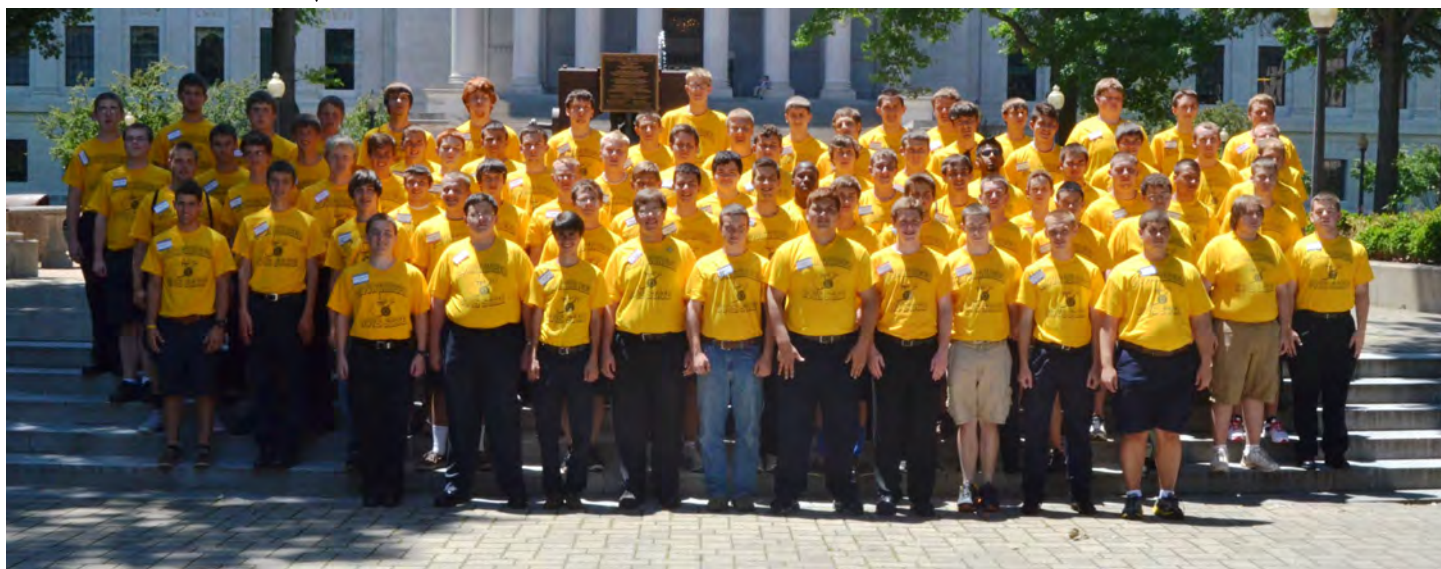
“BOARD OF PUBLIC WORKS AND LEGISLATURE GO TO CHARLESTON “