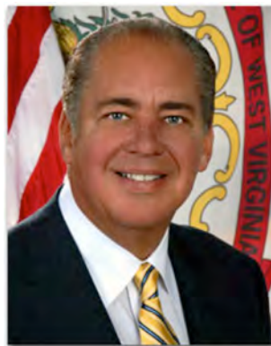
Earl Ray Tomblin W.Va.'s 35th Governor

Earl Ray Tomblin was sworn in as governor of West Virginia on November 13, 2011, and was sworn in for his second term on January 14,