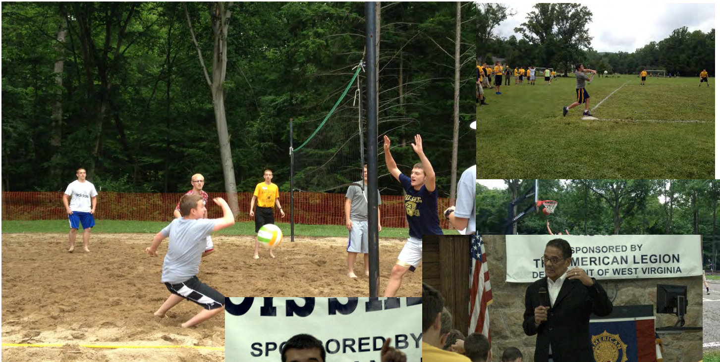
Federalists and Nationalists from each cabin face off in volleyball, softball, and basketball (above).